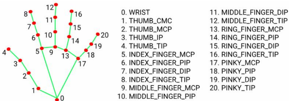
Figure 2 hand landmark

In this step, you analyze the positions of hand landmarks to recognize specific gestures. Implement the logic for recognizing gestures like thumbs up, peace sign, etc.